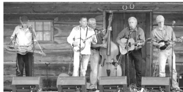
High and Lonesome